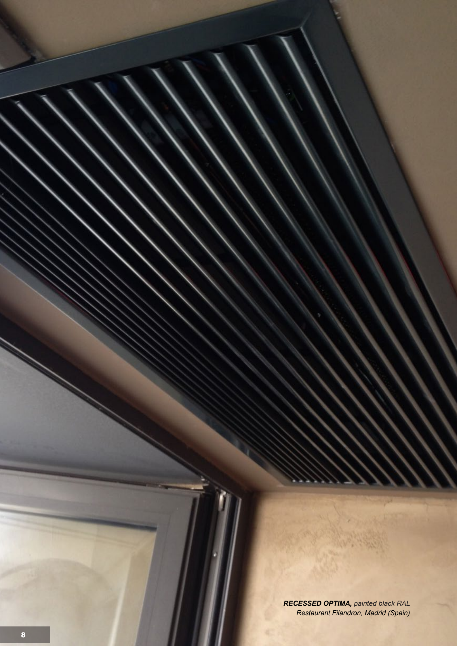
RECESSED OPTIMA , painted black RAL Restaurant Filandron, Madrid (Spain)