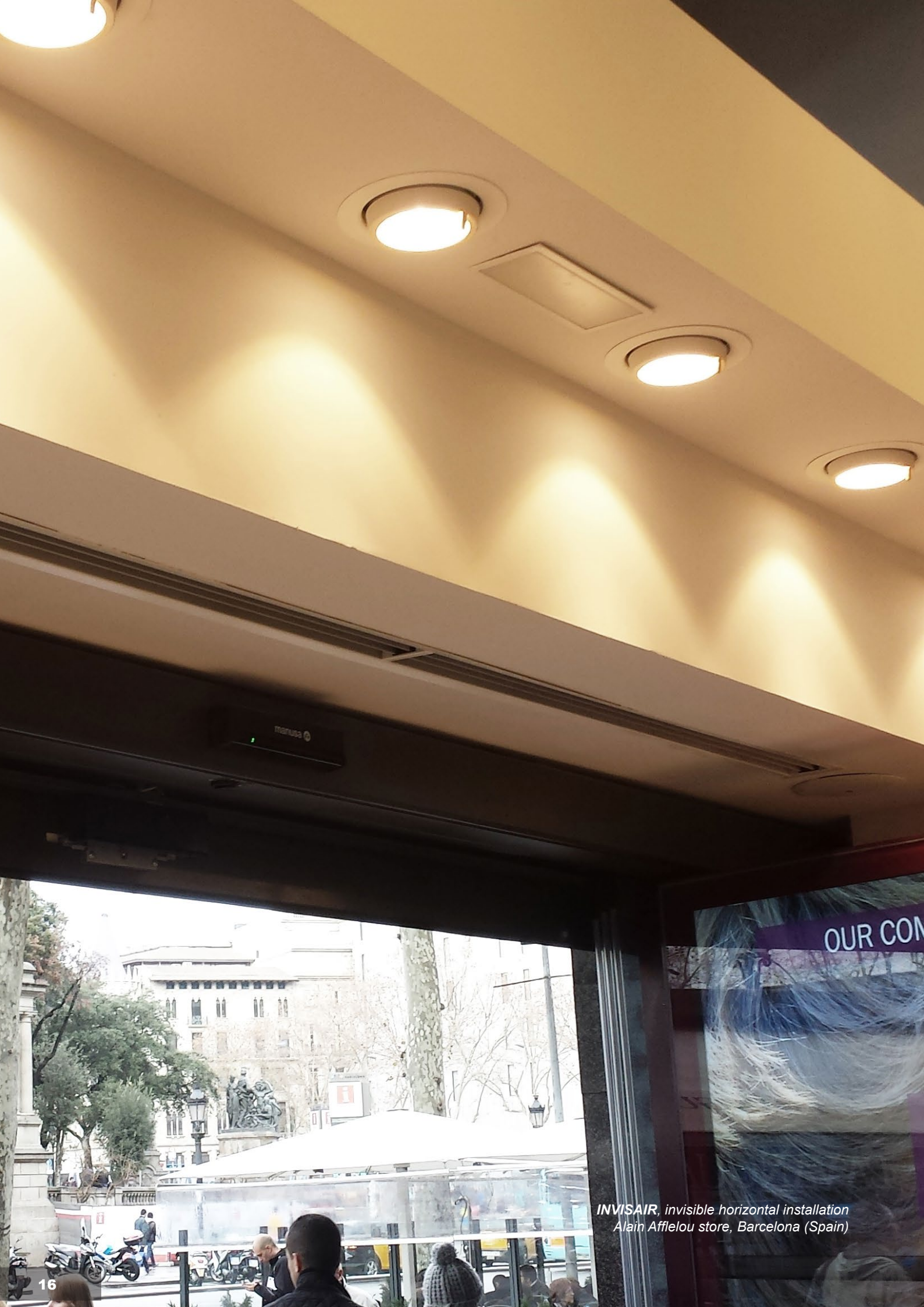
INVISAIR, invisible horizontal installation Alain Affelou store, Barcelona (Spain)