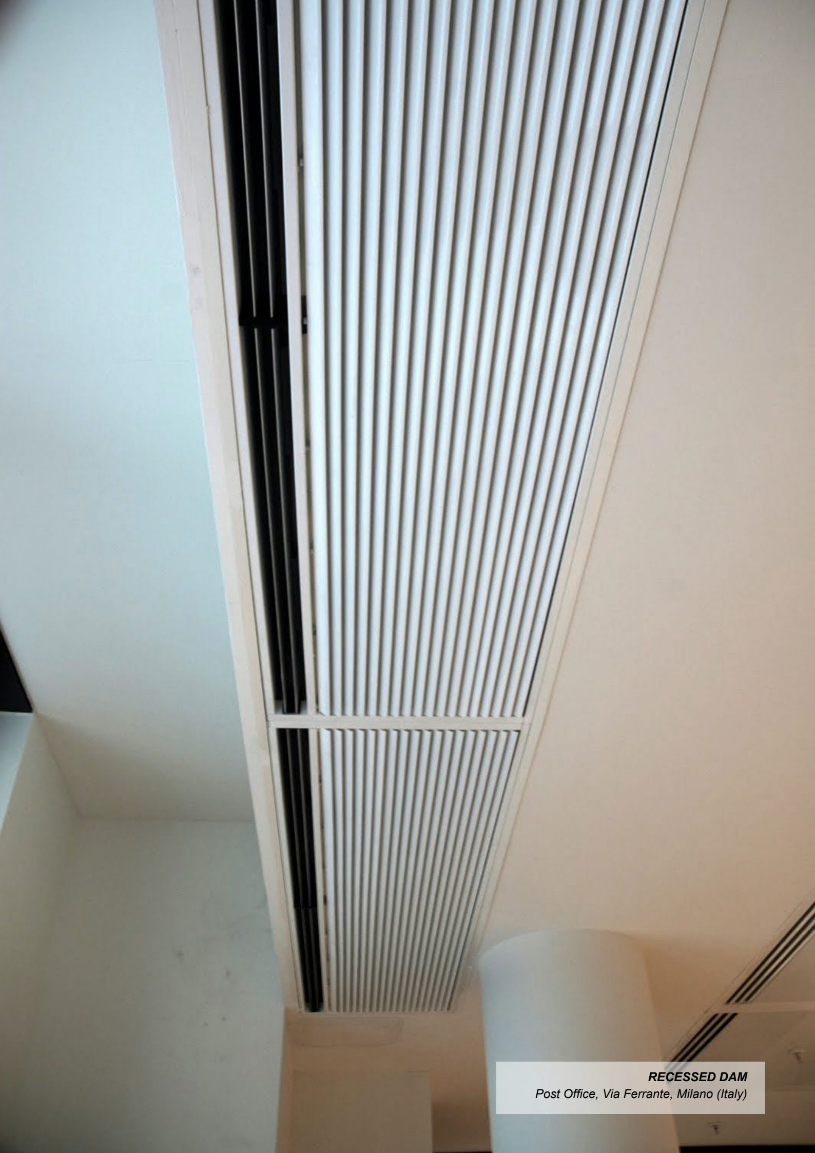
RECESSED DAM Post Office, Via Ferrante, Milano (Italy)