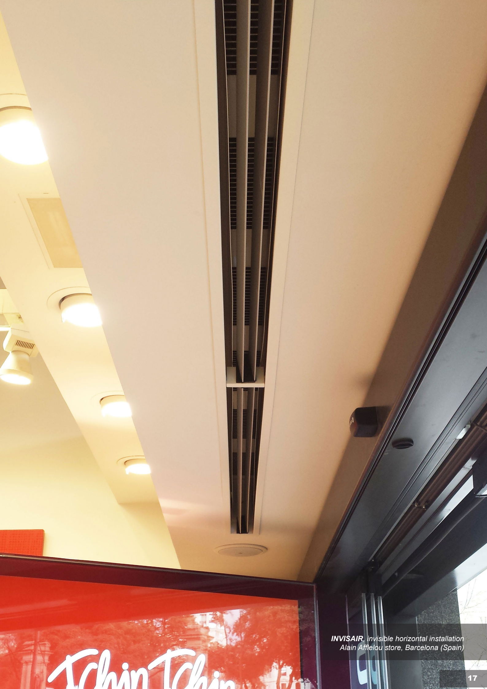
INVISAIR, invisible horizontal installation Alain Afflelou store, Barcelona (Spain)