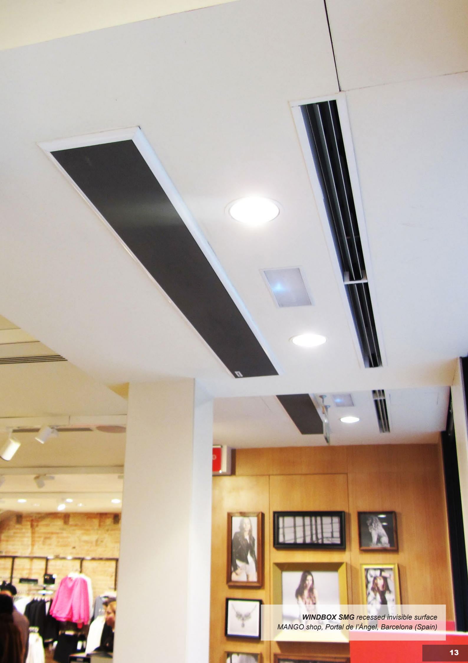
WINDBOX SMG recessed invisible surface MANGO shop, Portal de l'Àngel, Barcelona (Spain)