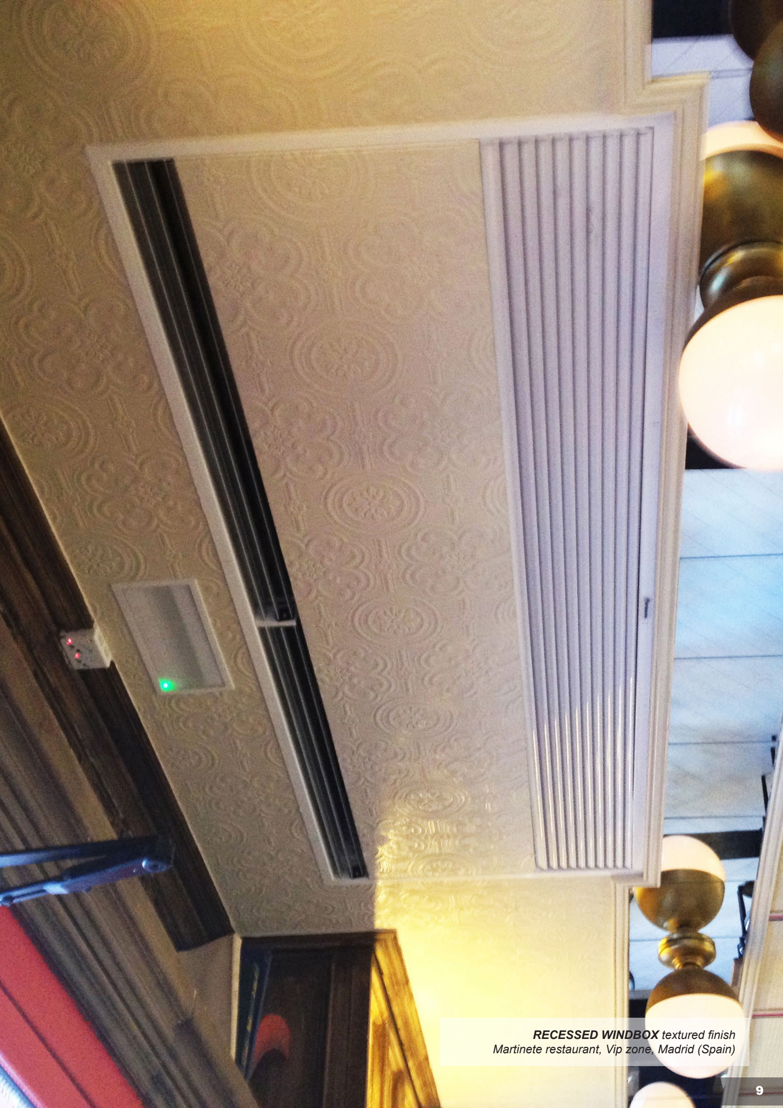
RECESSED WINDBOX textured finish Martinete restaurant, Vip zone, Madrid (Spain)