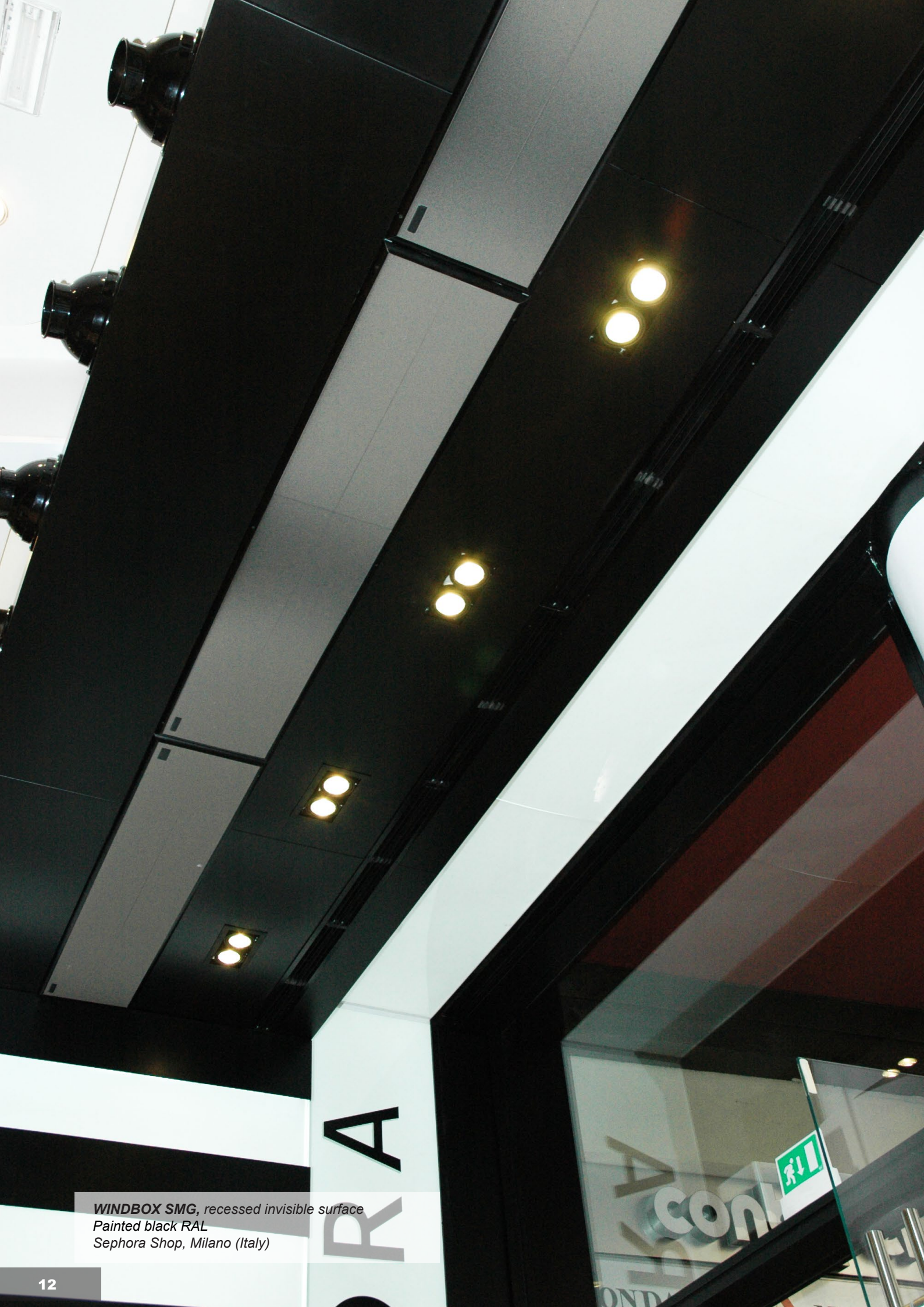
WINDBOX SMG, recessed invisible surface Painted black RAL Sephora Shop, Milano (Italy)